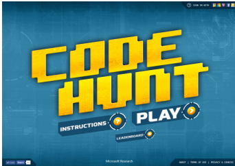
Figure 1. The opening screen of Code Hunt

Fun is seen as a vital ingredient in accelerating learning and retaining interest in what might be a long and sometimes boring journey towards obtaining a necessary skill. In the context of coding, there have been attempts to introduce fun by means of storytelling [2], animation ( www.scratch.mit.edu ) and robots (e.g. www.play-i.com ). Code Hunt adds another dimension – that of puzzles.