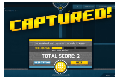
Figure 4. After completing a puzzle, the player gets a score

The result will be either a compilation error, with information in the bottom pane, or some mismatches or agreements with the goal algorithm. Figure 3 shows the code on the left, and the mismatches (red crosses) and agreements (yellow checkmarks) are shown on the right. If the code compiles and there are no mismatches and only agreements with the goal algorithm, the player wins this level – or as the game puts it, the player “CAPTURED!” the code, as shown in Figure 4.