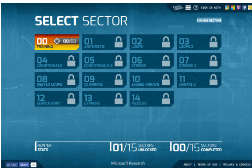
Figure 5. The game’s sectors, unlocked as the user progresses

After each level, the player is directed to immediately attempt a slightly more difficult level, thereby maintaining flow. Furthermore, the sectors except for the first one are initially locked. Players have to complete enough levels in a given sector in order to unlock the next sector. Figure 5 shows the list of sectors, most of which are still locked.