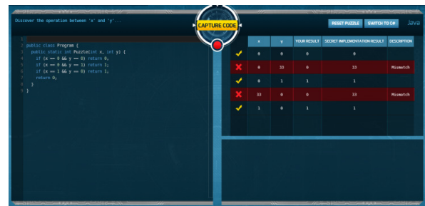
Figure 3 The Code Hunt main page, showing test results

The result will be either a compilation error, with information in the bottom pane, or some mismatches or agreements with the goal algorithm. Figure 3 shows the code on the left, and the mismatches (red crosses) and agreements (yellow checkmarks) are shown on the right. If the code compiles and there are no mismatches and only agreements with the goal algorithm, the player wins this level – or as the game puts it, the player “CAPTURED!” the code, as shown in Figure 4.